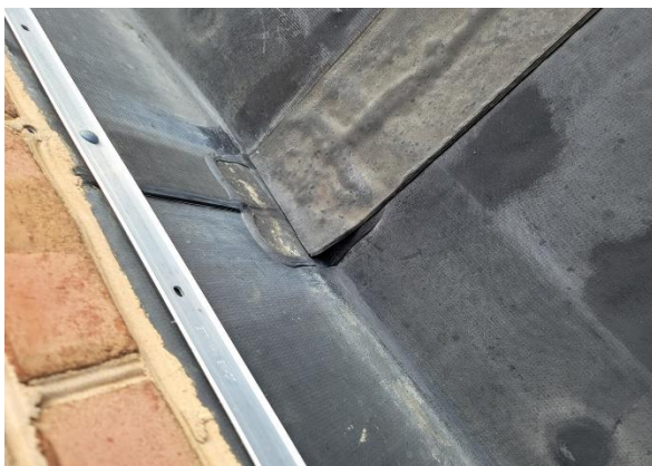
Deteriorating roof seams