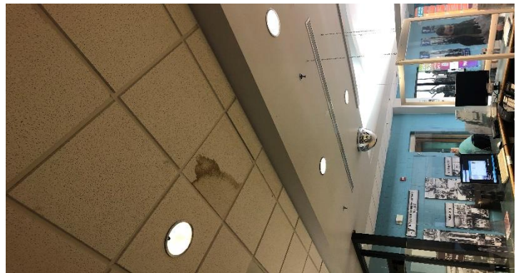
Leaks over costly technology