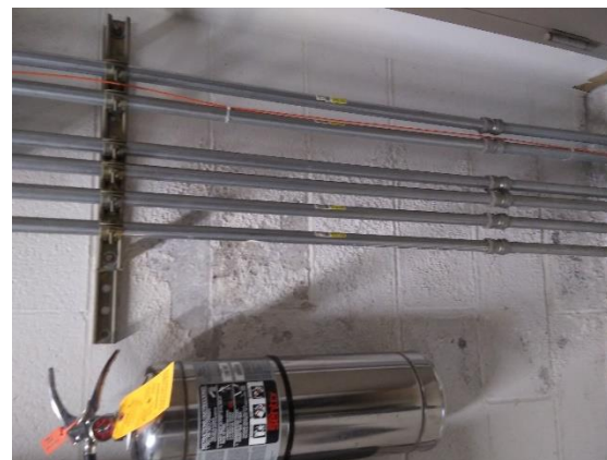
Damage to interior walls from soaking of walls