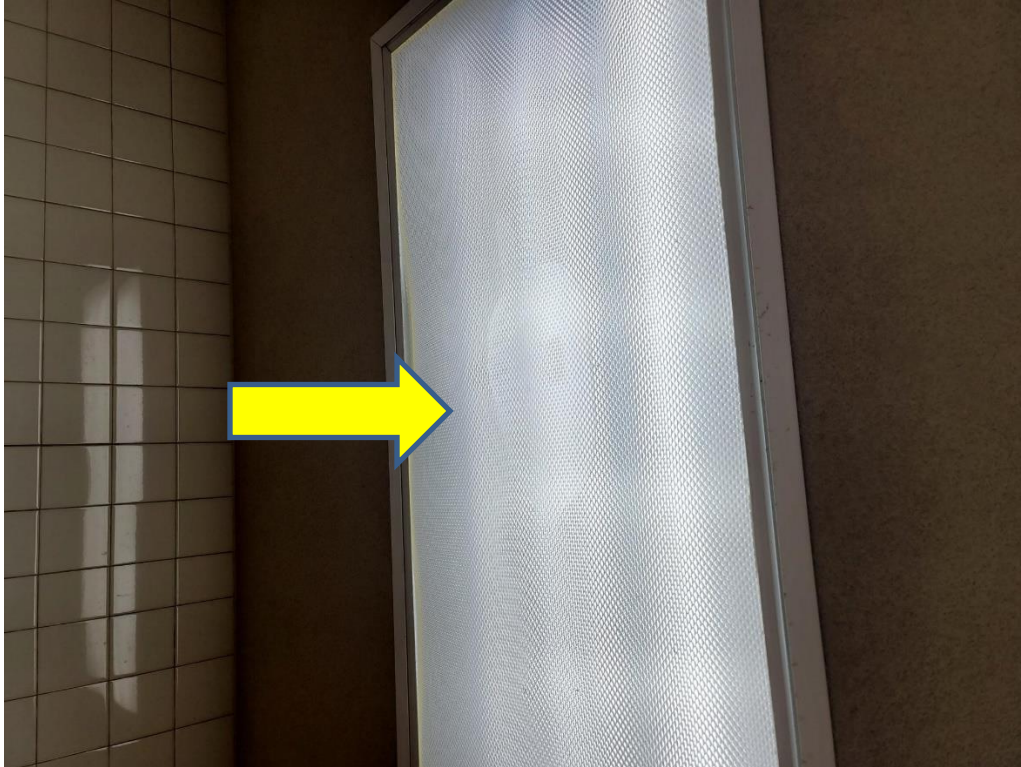
Roof leaks into lighting fixtures