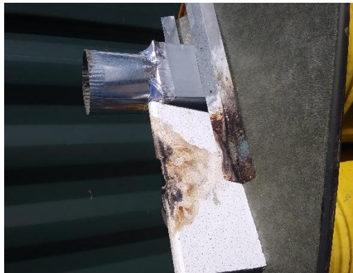
Some samples of staining and deterioration of ceiling tiles from leaks (numerous locations are leaking)