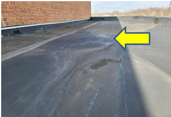
Bubbling sections on roof

The replacement of the roof is critical to the Y to continue to deliver on its mission to the community. The Y is a hub of activity every day and the demand on it is ever increasing. The Hagerstown Y is one of the only facilities that serves the population of the community along the generational lifespan. From babies to seniors, the Y provides programming to increase the overall health and well being of individuals through programs and services targeted to youth development, healthy living, and social responsibility. The Y serves over 8,000 members and over 20,000 program participants each year. In addition, the Y partners with numerous other organizations to deliver programs and services including Special Olympics, Washington County Public Schools, Maryland State Department of Education, Parkinson's Support Group, local mental health and addiction recovery programs and many others