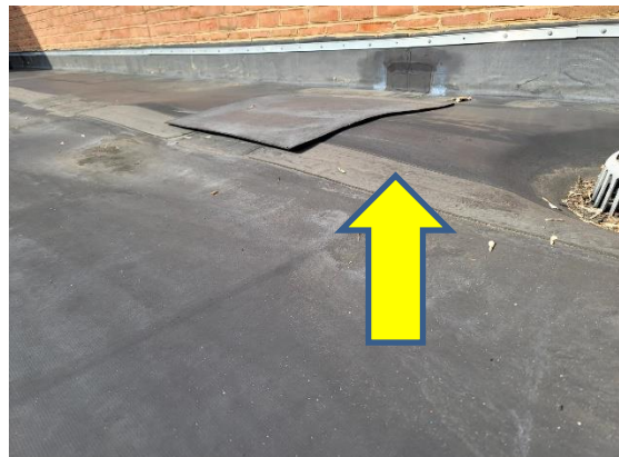
Previous repairs and bubbling